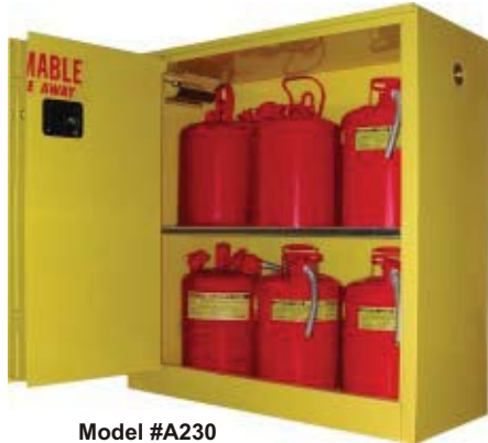
Model #A230 44"H x 43"W x 18"D

All cabinets comply with current OSHA regulations and are designed in accordance with the standards of NFPA Code 30.