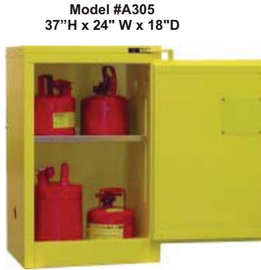
Model #A305 37"H x 24" W x 18"D