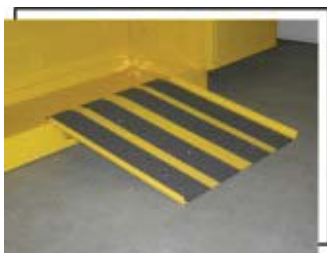
Model # BR24

Heavy-duty steel ramp has reinforced side edging, painted in 2-part durable urethane, and coated with non-slip stripping for grip.