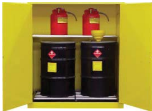
* Model #V1110 65"H x 56"W x 31"D