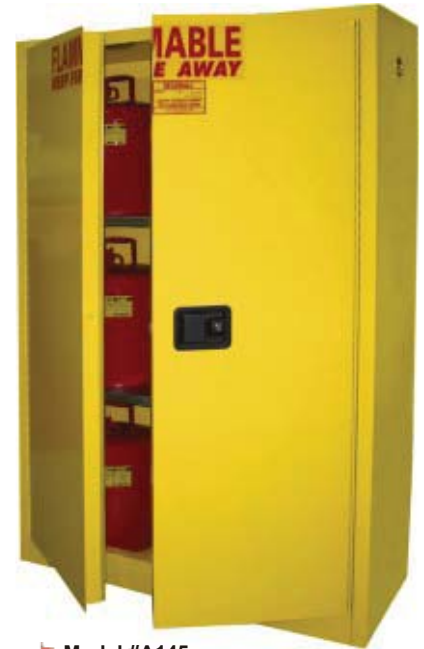
★ Model #A145 65"H x 43"W x 18"D