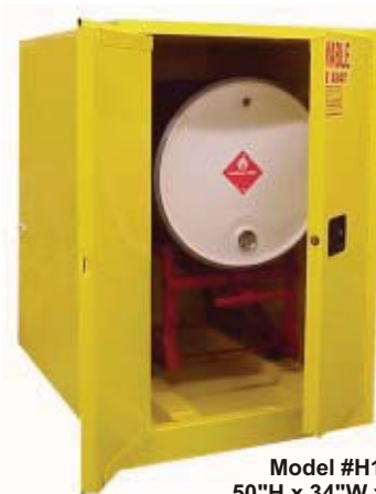
Model #H160 50"H x 34"W x 50"D