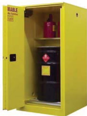
Model #V260 65"H x 34"W x 34"D

*Capacities may vary depending on size and shape of Container.