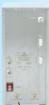
BOECO LAC-SA with 2 peristaltic pumps inside, 1 for cleaning, 1 for sample

input for alkaline detergent for automatic cleaning on every hour