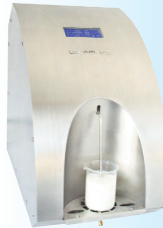
BOECO LAC LA

The following Parameters can be measured from the Ultrasonic system: Fat, Solid-non-fat (SNF), Density, Protein, Lactose, Milk sample temperature, Added water, Salts, Freezing point,