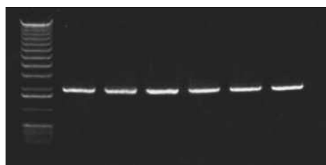
Consistent Yield of Endotoxin-Free Supercoiled Plasmid